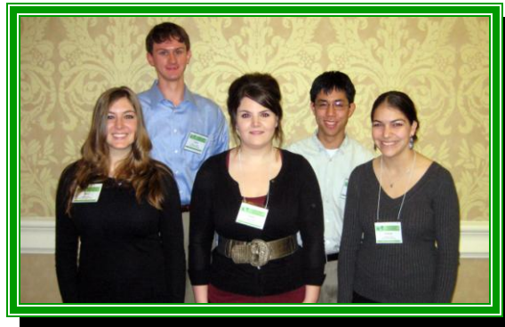
2 nd Place Texas A&M University