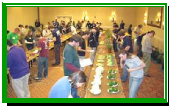
J. Benton Storey Judging Contest

The annual J. Benton Storey Horticultural Judging Competition was held on Sunday.