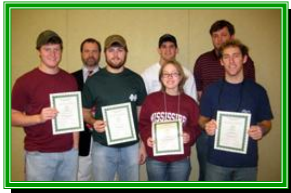
3 rd Place Mississippi State University