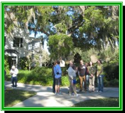
ACB toured Harry P. Leu Gardens

On Saturday, the clubs participated in Club Share. Each club gives a presentation on their yearly activities in order to share ideas on educational activities, civic activities and funding raising. The ACB members toured Harry P. Leu Gardens.