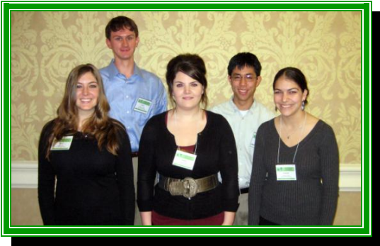
Texas A&M University