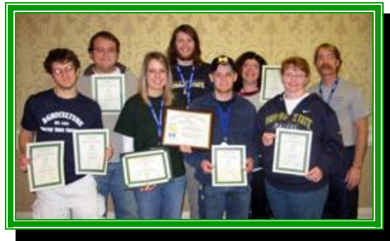
1 st Place Murray State University