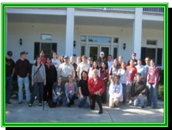
ACB Club members in attendance

ACB had another successful Southern Region ASHS conference in Orlando, FL