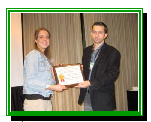
2<sup>nd</sup> Place – Murray State University