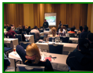
During Club Share, each ACB Club presents

The ACB had a very productive meeting. Saturday morning the ACB clubs gathered and shared club activities. Each club presented a PowerPoint presentation of their various activities over the past year. This is an excellent way for ideas to be shared. The Murray State Horticulture Club was selected to receive the Club Share Award for the best Club Share presentation.