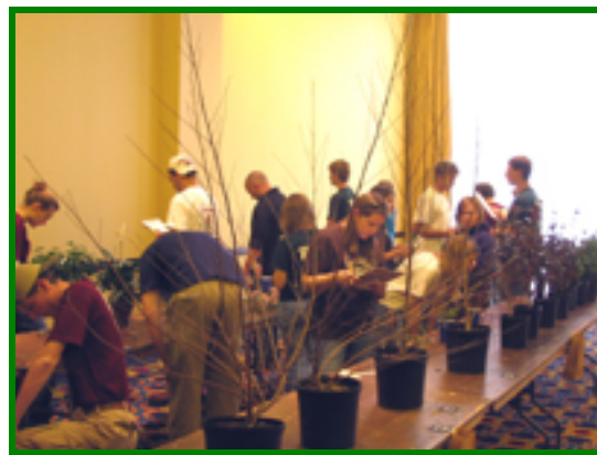
Scenes from the J. Benton Storey Horticulture Judging Contest