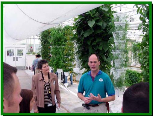
Students and advisors on a behind the scenes tour at Epcot Center

The ACB held a very productive meeting. On Saturday morning the clubs visiting the Epcot Center at Disney World and were given a behind the scenes tour.