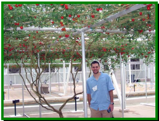
Student under the tomato tree at Epcot Center.

Later that day the clubs gathered and shared club activities. Each club presented a PowerPoint presentation of their various activities over the past year. This is an excellent way for ideas to be shared.