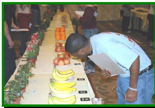
Scenes from the J. Benton Storey Undergraduate Student Horticulture Judging Contest

Faculty advisors and ACB Officers must setup and score the entire contest in one day. This would not be possible without a group of dedicated advisors and students. Special thanks is extended to the ACB