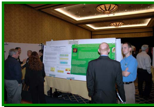
The poster session generated extensive one-on-one dialogue.

The poster session was very successful. Thirty-three posters were exhibited. The posters for all agricultural disciplines in SAAS were located in the same room.