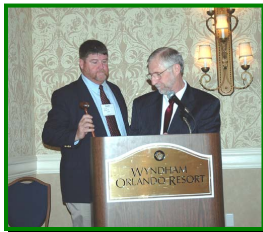
Out with the old and in with the new.